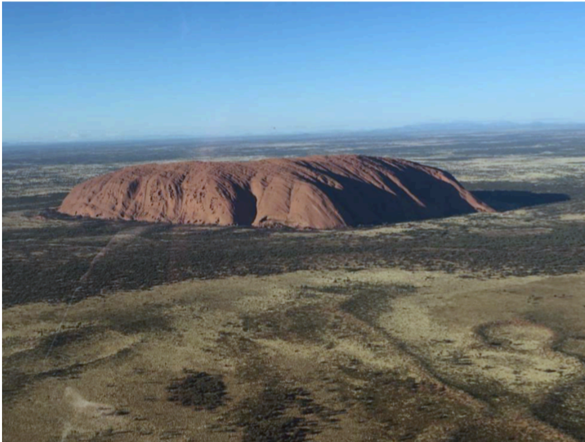
Uluru from the air

Geologists tell us that Uluru was formed some 500 million years ago, having once sat at the bottom of a sea. Today, it stands at 348 meters above ground. More impressively, some 2.5 kilometers of its bulk is underground. Here's a photo of Uluru taken from my helicopter flight: